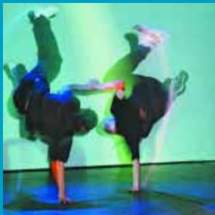
Urban Flava, Derby Dance Centre

Young people under 25 represented the greatest potential for growth. They make up 30.9% of the region's population