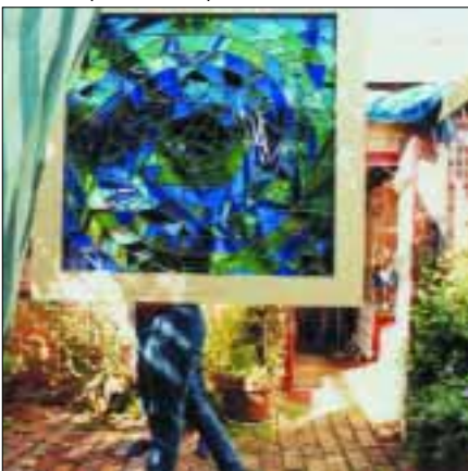
Northamptonshire Open Studios

'I find it the most stimulating local event comparable to the best at national level' Wirksworth International Festival