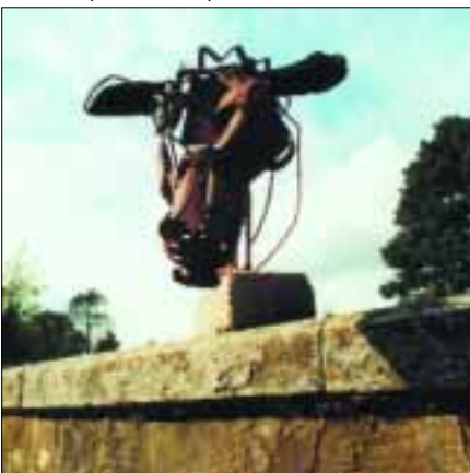
Northamptonshire Open Studios

'Lovely to see so many families enjoying a day out in Newark' Newark on Water