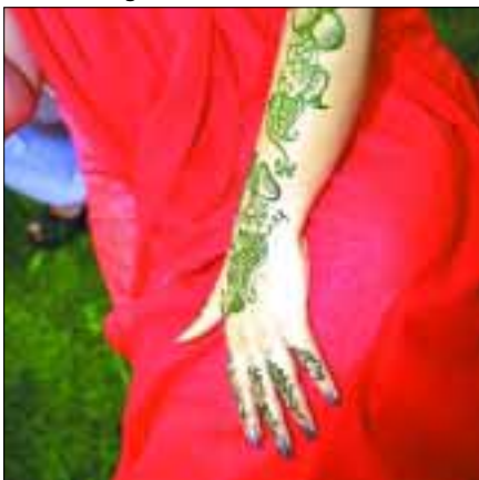
Leicester Belgrave Mela

This is just one example of research into the arts. For further examples visit the Arts Council England New Audiences website at www.newaudiences.org.uk